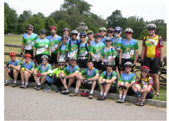
A few photos of some of our members

Visit our web-site – D-O-G-S.org ), find a ride that suits you and let the leaders know you are coming, bring your tandem or single bike, sign in, meet the DOGS, enjoy the ride, and socialize afterwards. Then you can decide if we are the club for you.